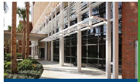
Front exterior of the University of Florida's Library West

the standards of the Energy Act of 1992 by 30 percent. Even greater conservation occurs outside. The landscaping around the building was strategically designed to decrease the amount of irrigation by almost 50 percent.