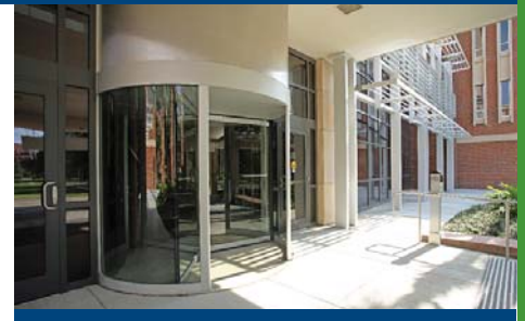
Library West's front entrance

Features for water efficiency were also included in this renovation. Library West now utilizes waterless urinals and low-flow plumbing fixtures. Thanks to these measures, water use has been dramatically reduced and now exceeds